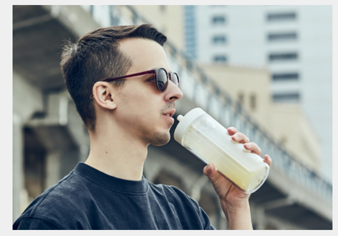
TO GO BOTTLE