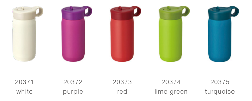
PLAY TUMBLER 300ml / 10oz