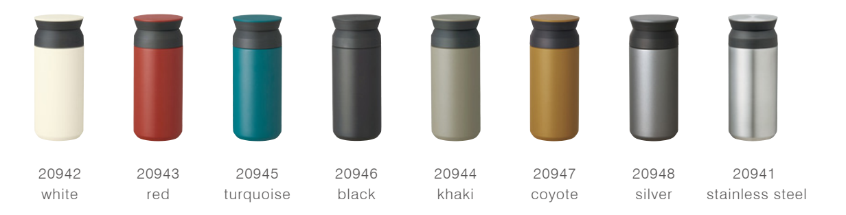
TRAVEL TUMBLER 500ml / 17oz