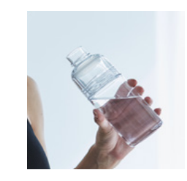
■ WORK OUT BOTTLE