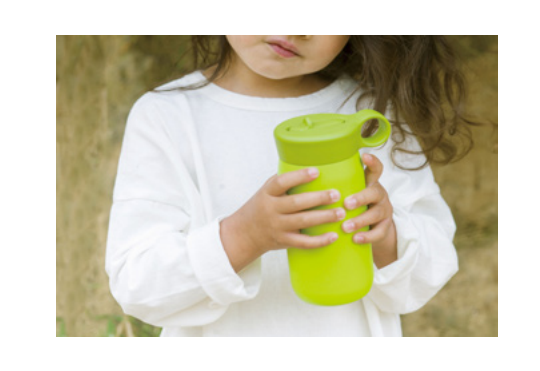
どこでも、楽しさを見つけて Find fun anywhere