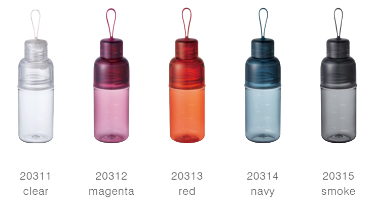
WORKOUT BOTTLE 480ml / 16oz