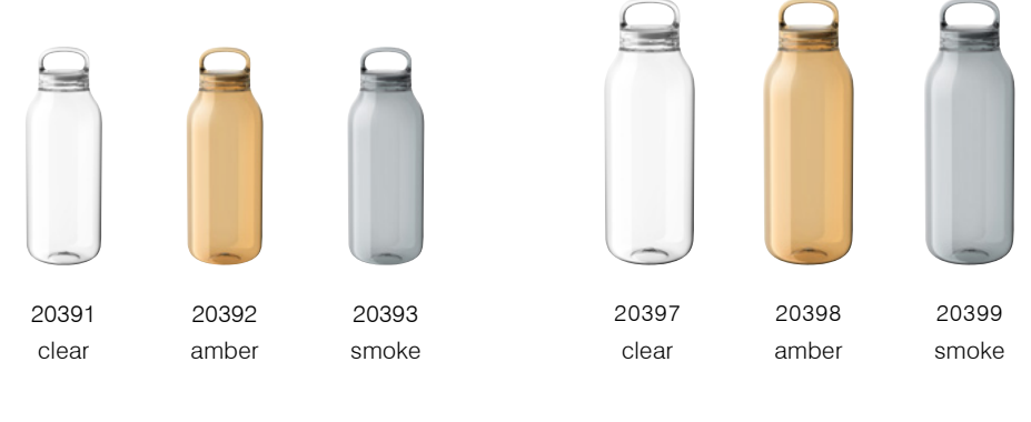
WATER BOTTLE 500ml / 17oz