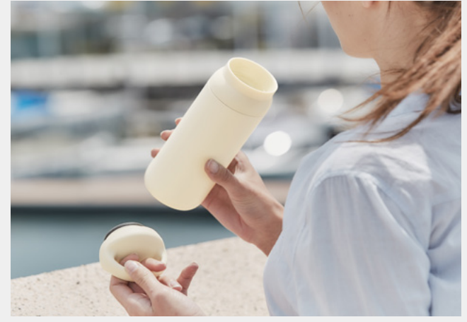
DAY OFF TUMBLER